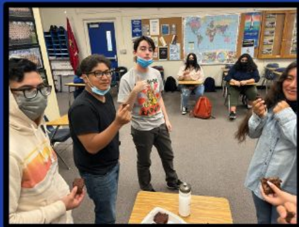
TUES- Learn about leadership/tech/military