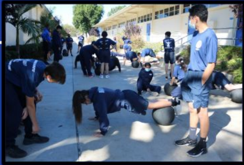
MON- Dress for PT