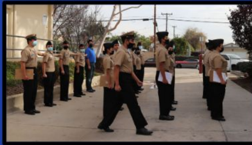
WED- Uniform Inspection