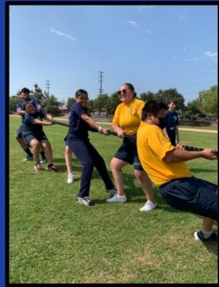
FRI- FUNDAY PT